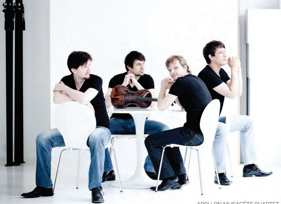
APOLLON MUSAGÈTE QUARTET