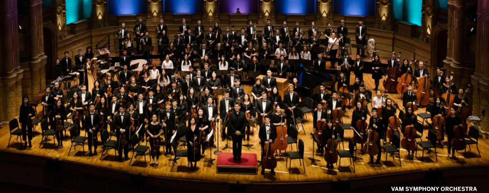
VAM SYMPHONY ORCHESTRA