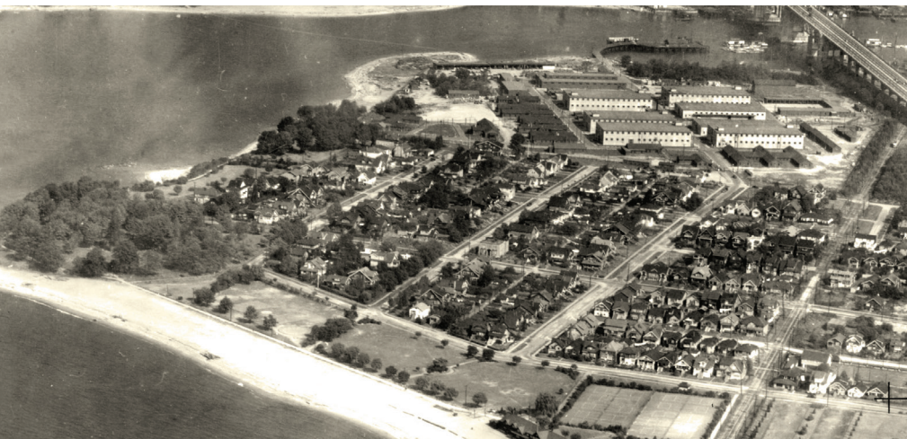
Aerial shot of Burrard Street Bridge, and the former Royal Canadian Air Force equipment depot buildings. C. 1945