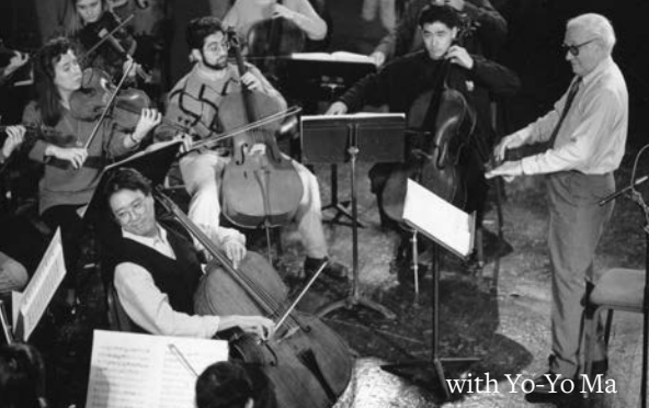
with Yo-Yo Ma