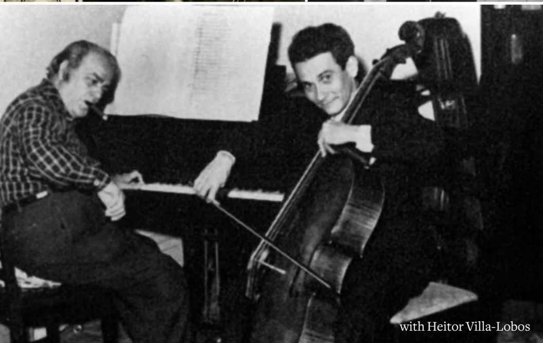
with Heitor Villa-Lobos