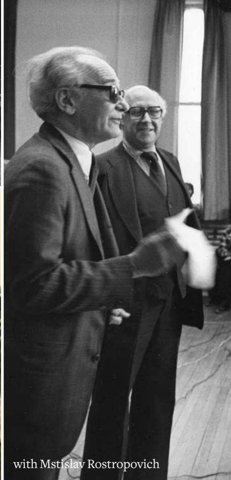
with Mstislav Rostropovich