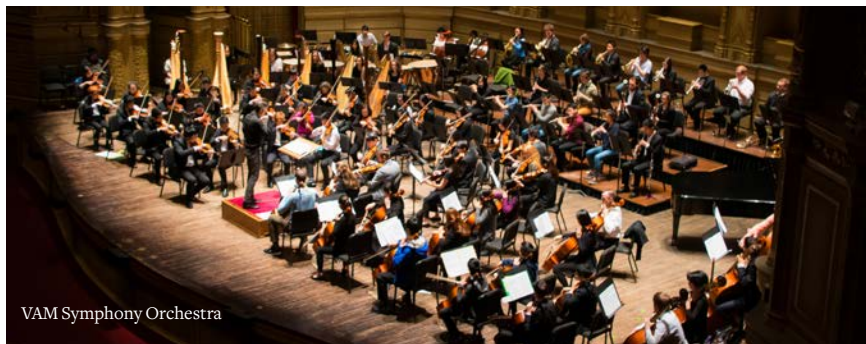
VAM Symphony Orchestra

Preparation and public performance of representative works from the symphonic literature. All instrumental students must be enrolled in the orchestra program. VAM Symphony Orchestra gives four concerts each year.